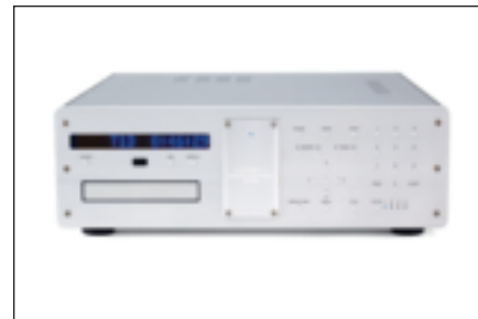
Evolution 525 Progressive DVD/SACD/CD Player 1080p output via HDMI™, adaptive contrast enhancement, intelligent color remapping, frame-rate conversion, Evolution CAST, Krell Current Mode topology, balanced circuitry, RS-232 control, Crestron I²P, 12 VDC trigger. 17.3 x 6.3 x 17.3 in. 43.9 x 15.9 x 43.8 cm