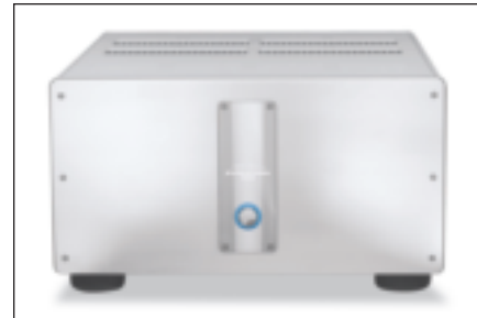
Evolution 403 Three-channel Power Amplifier 400 W, 800 W (8, 4 Ohms) Evolution CAST, Krell Current Mode topology, Active Cascode Topology 17.3 x 9.8 x 26 in. 43.9 x 24.8 x 66 cm