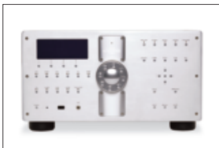
Evolution 707 Surround Sound Preamp/Processor Two zone preamp/processor with 8.4 total channels, individual 24-bit/192 kHz digital-to-analog converters, Analog Throughput, HDMI switching, 12-channel digital room EQ, RS-232 control, 12 VDC triggers, Evolution CAST, Krell Current Mode topology, balanced circuitry, software upgradeable via flash memory. 17.3 x 9.8 x 22 in. 43.9 x 24.8 x 55.9 cm