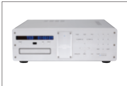
Evolution 505 SACD/CD Player Krell-designed DAC reconstruction filters, Evolution CAST, Krell Current Mode topology, balanced circuitry, multi-channel output, RS-232 control, 12 VDC trigger. 17.3 x 6.3 x 17.3 in. 43.9 x 15.9 x 43.8 cm