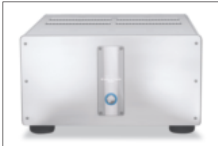
Evolution 900 Monaural Power Amplifier 900 W, 1800 W (8, 4 Ohms) Evolution CAST, Krell Current Mode topology, Active Cascode Topology 17.3 x 9.8 x 26 in. 43.9 x 24.8 x 66 cm