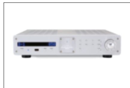
Evolution 222 Stereo Preamplifier Evolution CAST, Krell Current Mode topology, balanced circuitry, menu display with remote control, RS-232, Theater Throughput. 17.3 x 3.8 x 18.3 in. 43.9 x 9.7 x 46.4 cm

Component dimensions are described by width x height x depth. All power ratings are per channel.