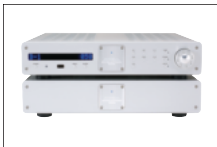
Evolution 202 Stereo Preamplifier Evolution CAST, Krell Current Mode topology, balanced circuitry, menu display with remote control, separate power supply, RS-232, Theater Throughput. 17.3 x 7.6 x 18.3 in. 43.9 x 19.3 x 46.4 cm